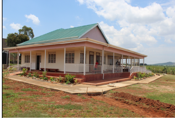
The clinic gardens planted in June are doing good.