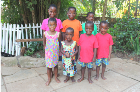
The children soon going to SOS orphanage.