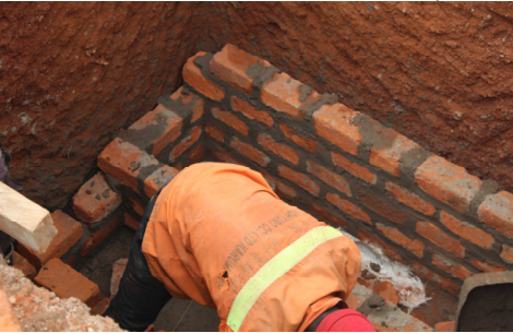
A must is a placenta pit in case we have a birth.