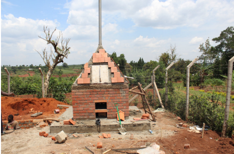
The start of medical incinerator - Chimney soon!