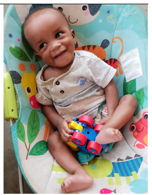
There is now a big sparkle in the eyes above..

Remember https://smile.amazon.com/ch/33-0627579 And Welcome Home and the children in your giving