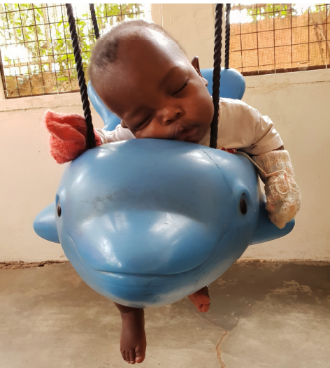
He loves to rock himself to sleep in the dolphin.