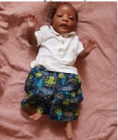
Secure in this new place of food and shelter