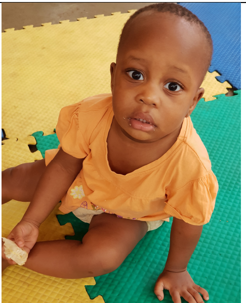
What is this little ones future?