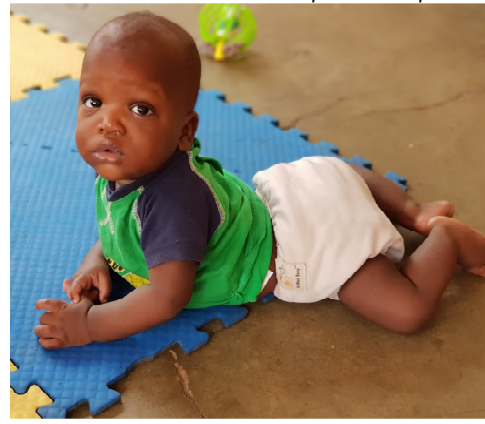
What are you doing with a camera?