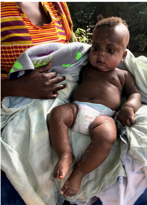
The same child improved with medical care.