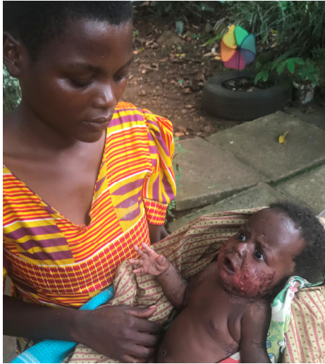
A village child who looked like death a week ago.