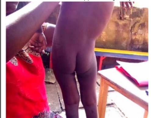
Same boy filling out.