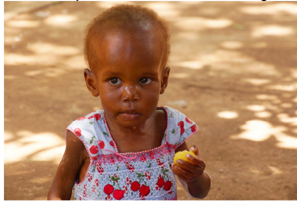
Above 5 th October 2015 Below 1 st December 2015..

All these 6 pictures are of the same little girl!!!