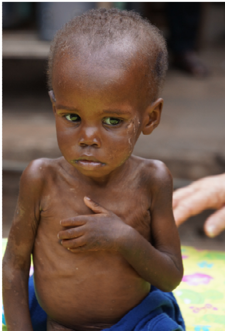
Above 1 st October 2015 Below 1 st December 2015.

To Love, Care, and Pray Destitute Babies Back to Health; or into Jesus Loving Arms