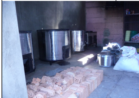
Above: Our extended kitchen & new stoves.