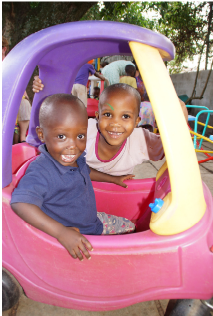
Above: The joy of a childhood that is safe.