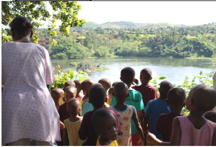
Above: looking at the River Nile.

To Love, Care, and Pray Destitute Babies Back to Health; or into Jesus Loving Arms