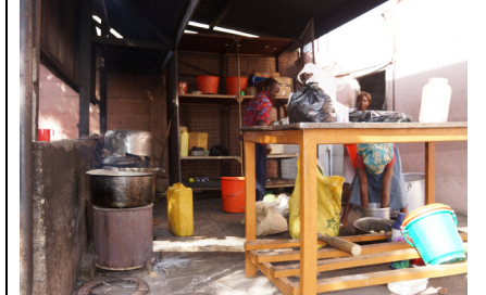
Above: Our old stoves on the left of the picture.