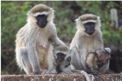
Above: Some Mumma's watching us.

It seems incredible that so much can happen in one month. This past month we had additional activities so that the children have some extra special happy and unusual memories , especially for the ones that will move on soon. This meant many outings in the vans to local adventures along with our mums and volunteers. One of those drives was for all 45 bigger children to the Nile Resort for sodas and cookies, play in the resort playground, see monkeys, the River Nile, and the fishermen in their boats. There was lots of excitement when the monkeys came in real close and could be seen very clearly. The big babies also went for their outings to see monkeys, cows, goats, chickens, ducks, and of course, Lake Victoria. All the trips were delightfully noisy and happy, especially for the group that saw a small plane (they thought it belonged to Mumma Mandy) taxi and take off. Parties were also held at the home that involved treats of cakes, marshmallows, balloon fights, singing and lots of love.