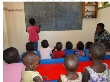
Mercy helping with class.