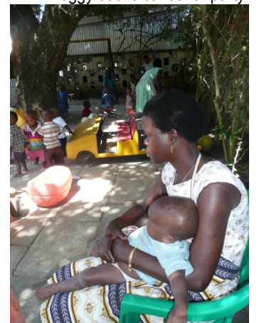
Babies new shaded safe playground