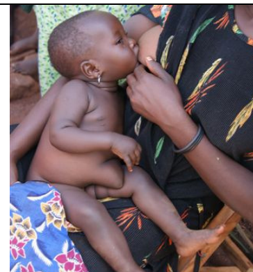
Umbilical hernia surgery (see navel)