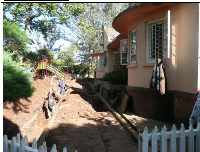
The trench being dug at the front.

“To Love, Care, and Pray Destitute Babies Back to Health; or into Jesus Loving Arms.”