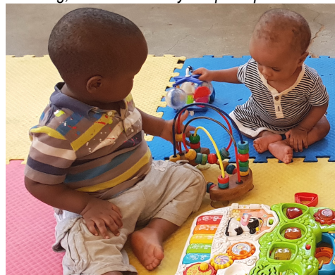
Developmental toys for the very young.