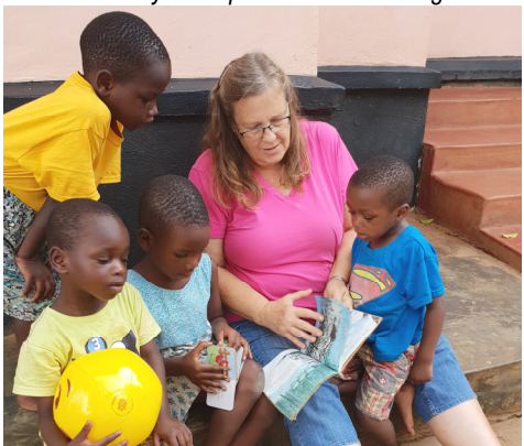
Books and reading are a big part of each day.