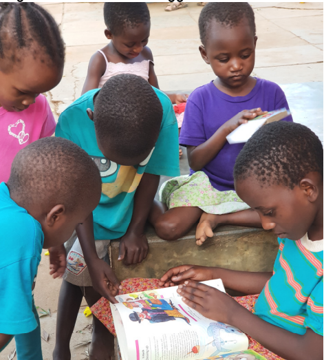
Reading, a wonderful way to open up the world.