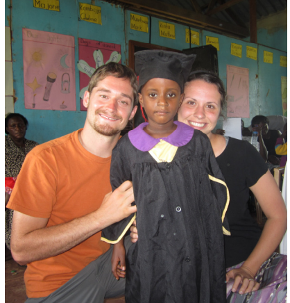
Above: attending a class graduation

Below: lots of fun for all- including the mums, a day of face painting