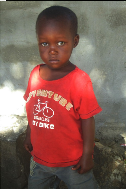
Above: a new little one – still very uncertain

To Love, Care, and Pray Destitute Babies Back to Health; or into Jesus Loving Arms