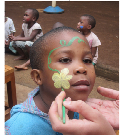
Above: such trust