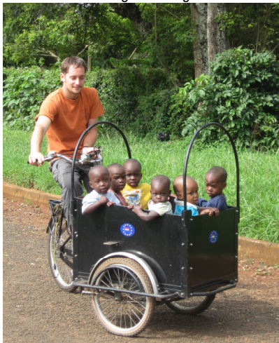
Above: an enjoyable outing