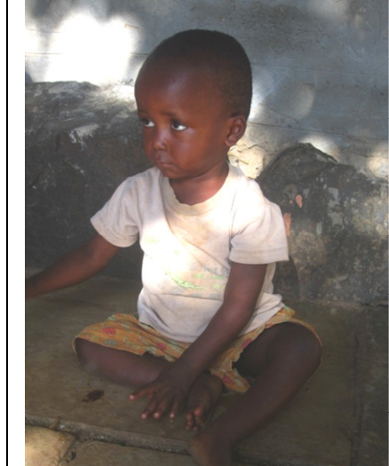
Above: a new little one, sad for a season