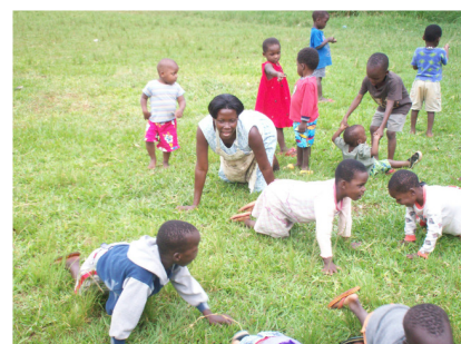
Daily activity at the park across the road