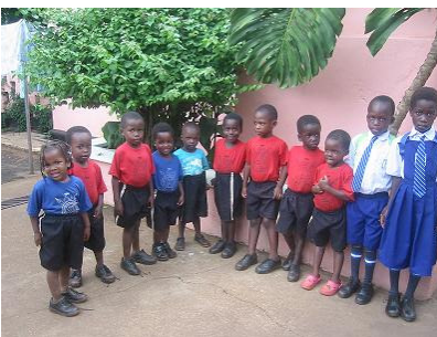
Our school children