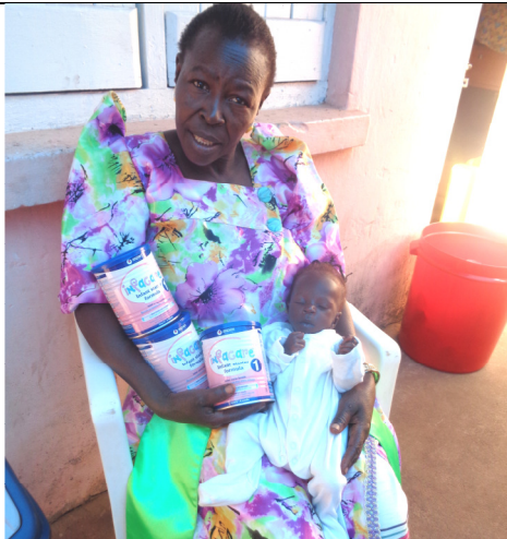
Above: Failure to thrive - 6lb 4 oz. @ 3 1/2 months old

To Love, Care, and Pray Destitute Babies Back to Health; or into Jesus Loving Arms