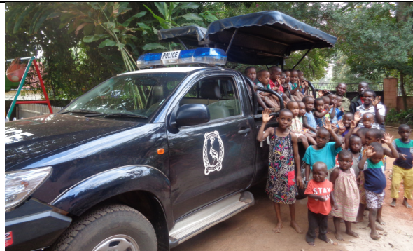
Above: Many of our older children on a visiting police car.