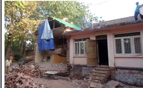
Above: The major house repairs under way now.