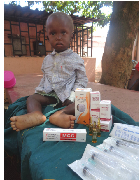
Above: Malnutrition & infection handled at W. Home