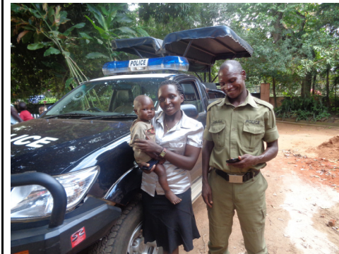
Above: Malnourished and abandoned / in via Police.