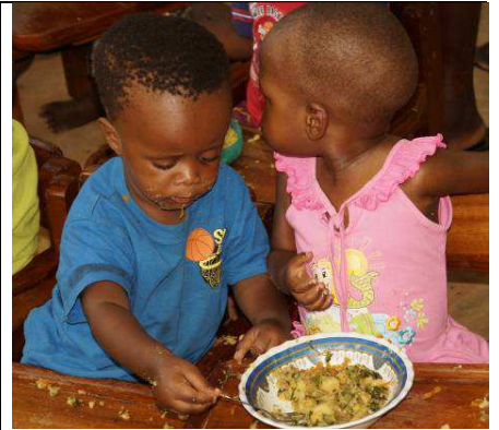
Above: Stealing the neighbor's food.