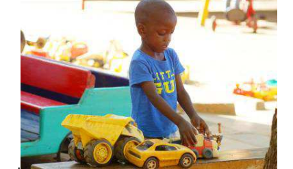
Above: toys on the balance beam.