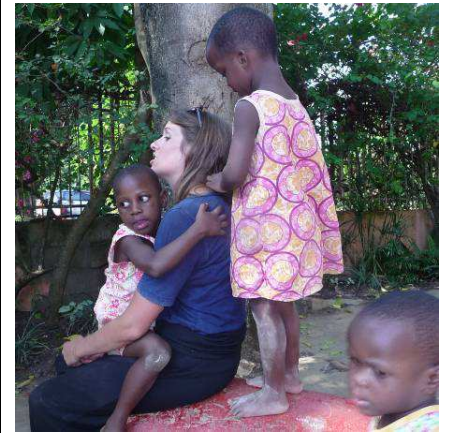
Above: Long hair is fun to play with.