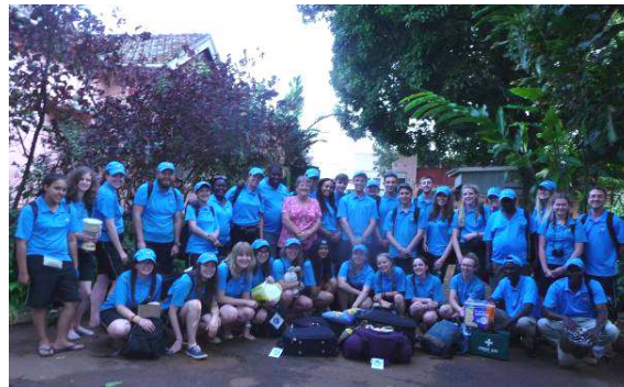
This school team from England visits annually