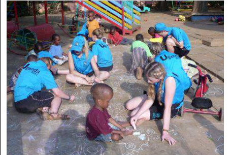
Above: Chalk and concrete = lots of creativity.