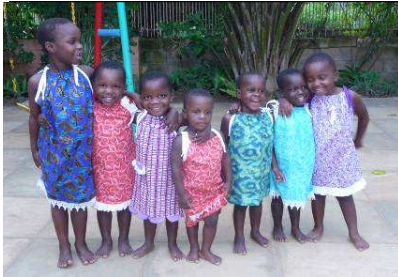
Our girls proudly wearing new dresses