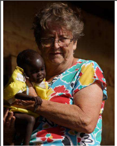
Above: 8lb at 14 months, parents no work