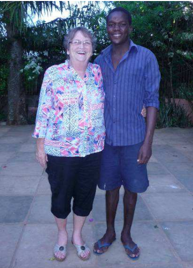
Above & Below: Two students we feed.