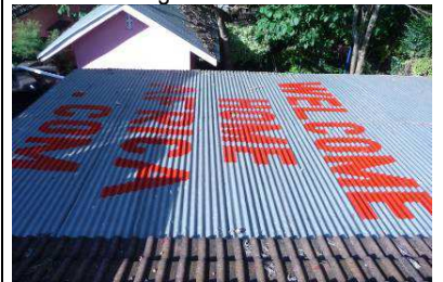
Above: Our roof sign for Google Earth.