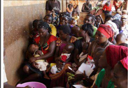
Above: Mums with their needy children.