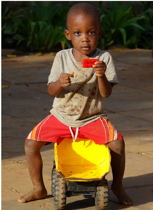
A child's life of play with Tonka's and Lego's.

To Love, Care, and Pray Destitute Babies Back to Health; or into Jesus Loving Arms