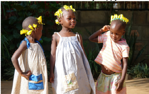
Flower headgear that our girls make to wear.