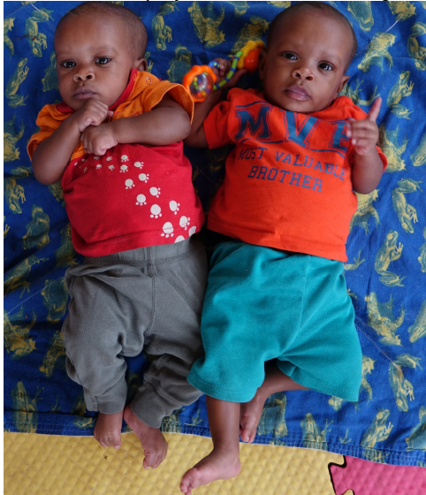
One of our sets of healthy happy twins.