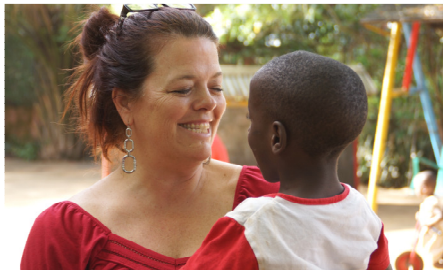
Above: pushing through barriers with love.