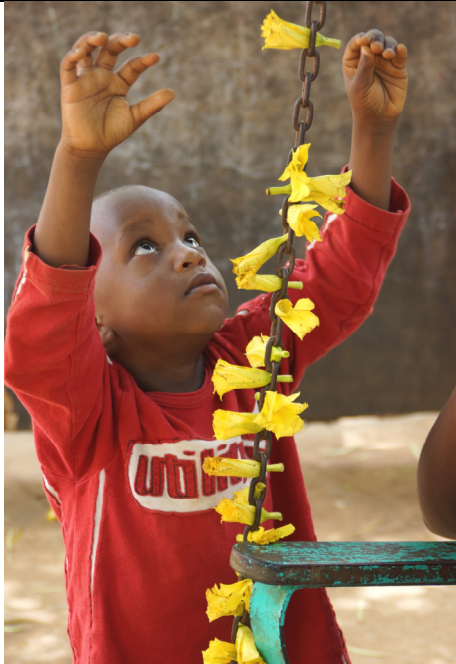
Above: quite a creative little guy.

To Love, Care, and Pray Destitute Babies Back to Health; or into Jesus Loving Arms