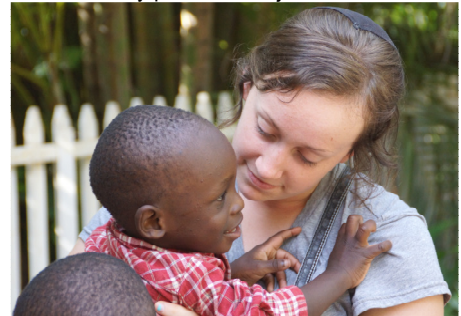
Above: 6 months of love and nurture.