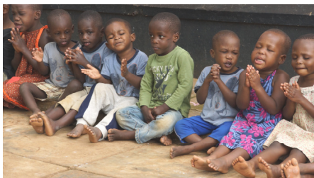
Above: Thankful for their coming snack.