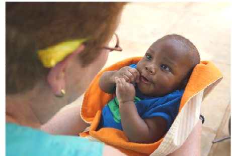
Above: a loving stable influence twice a year.