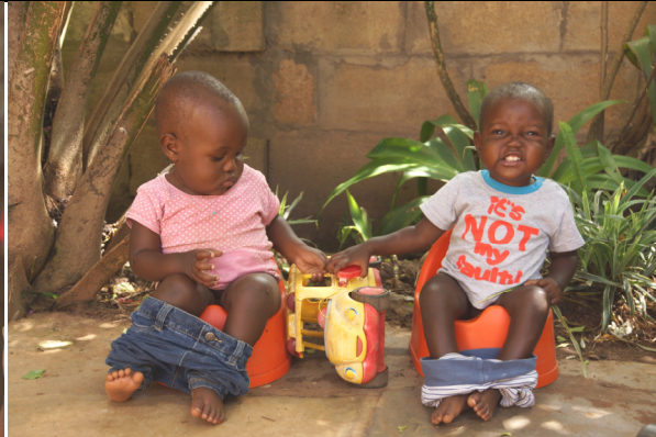
Above: Even at potty time there can be a power struggle.