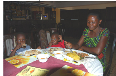
First time at a restaurant, a long trip home.