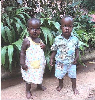
New little ones this past month.